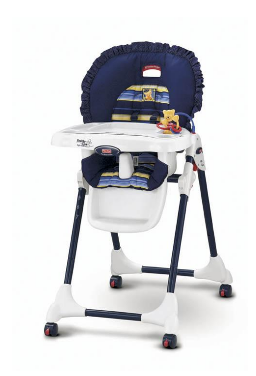
B2875 Healthy Care™ High Chair